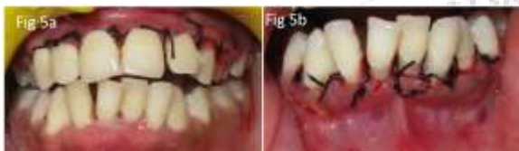
Sutures placed with 4-0 silk suture with interrupted suturing technique