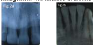
Iopa showing horizontal bone loss

Hence, the diagnosis of pubertal gingival enlargement was made as the enlargement was initiated at around puberty.