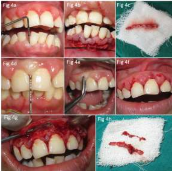
Internal level gingivectomy performed in mandibular and maxillar anterior teeth region