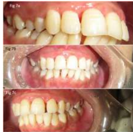
Recall after 3 months