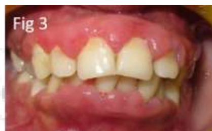
Recall after 2 months of Phase 1 therapy

The patient and her parents were made aware about the