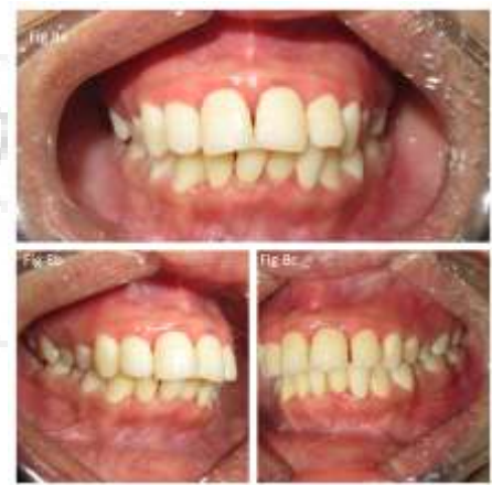
Recall after 6 months