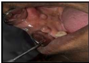
Clinical picture of the lesions. fig: d

We noticed there were no reductions in size or changes in the shape of both the lesions. Then we sent the patient for VELscope examination to find out, if any, dysplastic changes were associated with it. VELscope report showed that there were no dysplastic changes in both the lesions (fig: e). Then, we sent the patient for blood investigations and all the values were within the physiological limit.