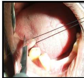
Excision with Scalpel fig: i