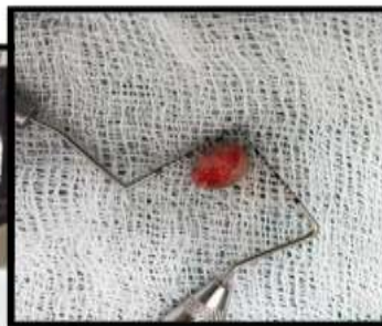
Excised tissue by Scalpel fig: k