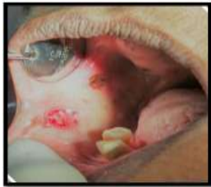
Immediate Post-Operative View

While in the histopathological picture of laser excision, there were warming, welding, denatured proteins (fig: l). The cellular tissues showed carbonization and vaporization. Also, epidermal destruction and marginal charring were observed with laser biopsy. These effects are the result of energy transmitted by a laser beam.