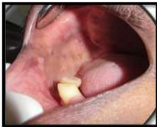
14 th day post-operative fig: o