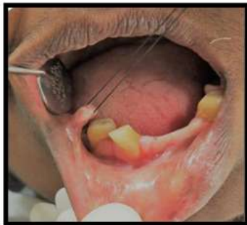
Sutured lesion for better handling fig: h