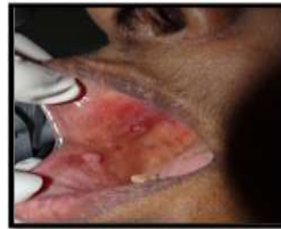
7 th day post-operative view fig: n