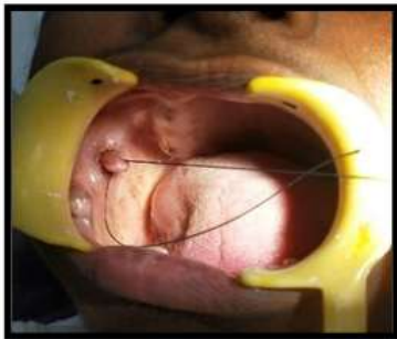
Sutured lesion for better traction fig: f

Excision of this lesion was done with the help of a conventional scalpel (figure: I). Immediate after excision bleeding was seen with scalpel excision while arrested bleeding was noted with the laser excision (figure). Both the excised tissues were measured (figure j and k). After excision, both the tissues were sent for histopathological investigations.