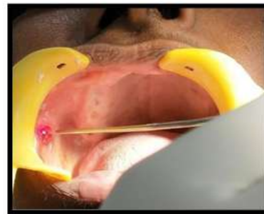
Excision with Laser fig: g