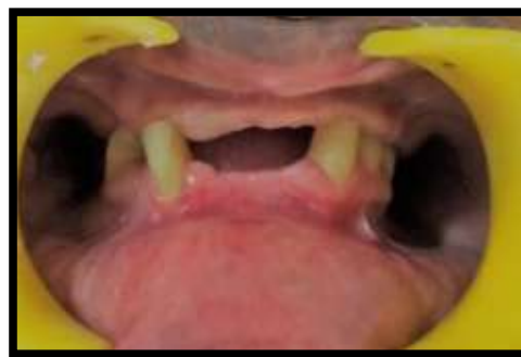
Intra-oral pictures fig: b