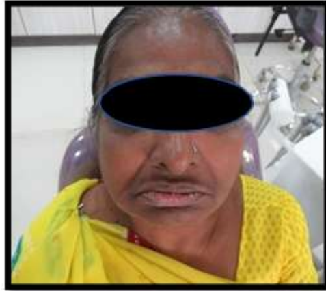
Normal extra-oral findings fig: c

On dental examination, it was found that she was partially edentulous with a history of using ill-fitted dentures for about a year. It was irritating to her buccal mucosa, so she stopped wearing the denture by herself. Calculus deposits were seen. There were no adverse habits. Her gait was normal, she was mesomorphic with pulse rate, blood pressure and other vitals were normal.