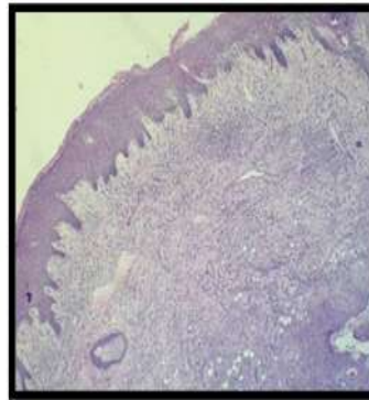
Histopathological section of tissue excised by scalpel fig: m

H and E histopathological picture of a scalpel and laser excision showed Stratified squamous epithelium and numerous plump fibroblast and dense collagen fiber bundles along with blood vessels and few inflammatory cells. So, overall clinical features were suggestive of "Fibroepithelial Hyperplasia". No epidermal destruction was noted with scalpel biopsy (fig: m).