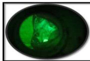
No dysplastic changes on VELscope fig: e