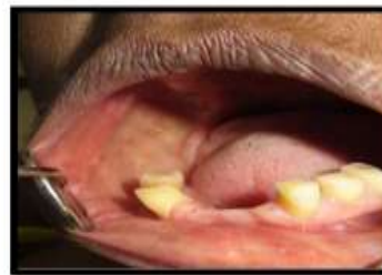
21 st day post-operative fig: p

Wound healing was clinically evaluated over 7 days, 14 days, 21 days after the surgical procedure with the help of WHI (Wound Healing