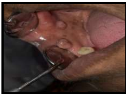
Intra-oral pictures fig: a

A 56 year old, partially edentulous female patient reported to the Department of Periodontics, Nair Hospital Dental College, Mumbai, India, with a chief complaint of two soft tissue masses on the right cheek since 7-8 months. She was apparently all right until 8 months back, when she noticed two soft tissues growth on her right buccal mucosa which was interfering with her ability to eat and chew normally. The soft tissues growth was not associated with any pain or suppuration. They gradually increased to the present size.